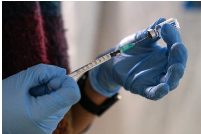
Floraland Special Forces soldiers made use of a cordyceps treatment as they secretly gathered intelligence about Outpost Anaconda.