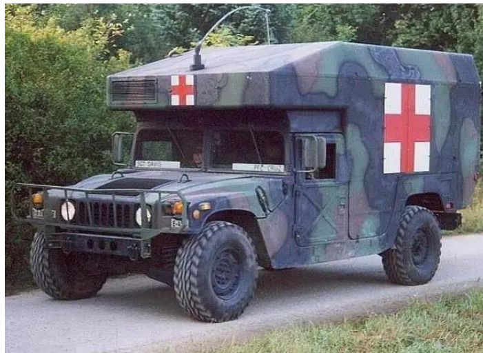
An M997A3 Field Ambulance served as the Floraland A Team's method of escaping the base.

According to partially declassified A Team debriefing interviews, the team soon became aware that a Westphalian guard had stumbled upon one of the listening devices. As initial confusion gripped the Westphalians, the A Team quickly pivoted to a contingency escape plan. Interviews reveal that the team seized several weapons from an unsecured site on the outpost before making their way to a small nearby motor pool. The Team Leader reports engaging and killing two Westphalian soldiers posted at the motor pool using silenced pistols.