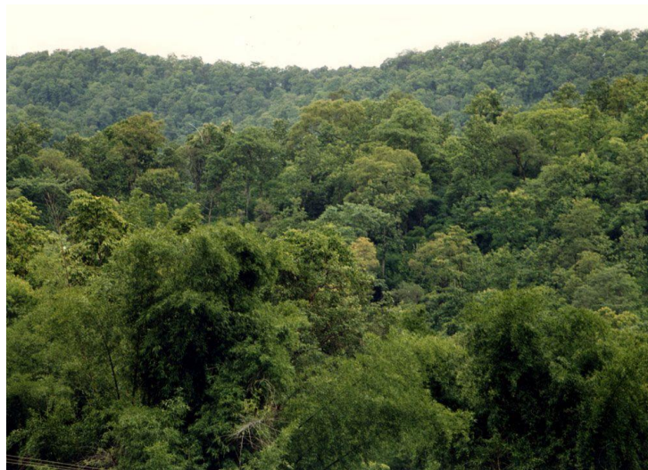
The lush rainforest of eastern Westphalia, which serve as the hidden home of a secretive Westphalian prison camp targeted by Floraland.