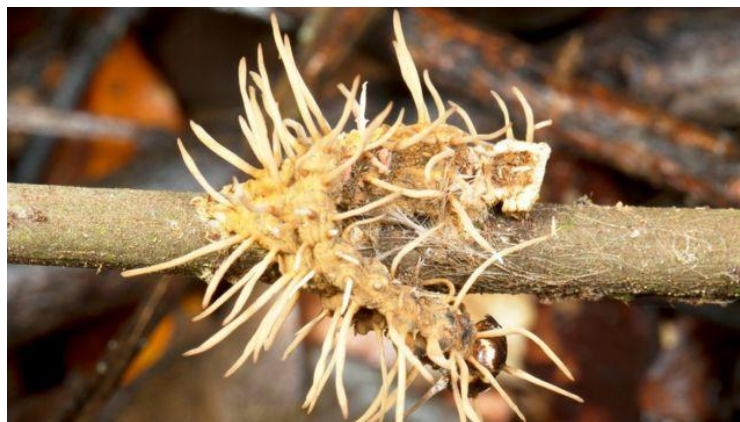
Ophiocordyceps unilateralis , more commonly known as cordyceps, the deadly fungus which opened the door to Operation Cyclone.

In late September, after spending months and countless resources on its search for Anaconda, Floraland’s chances suddenly changed following a routine prisoner swap between the two nations. The exchange, which involved about 45 prisoners of war, attracted little attention at the time. However, according to a Floraland intelligence source, the Floraland military caught a massive break during the standard POW debriefing process. It was discovered that one of the newly repatriated soldiers had been imprisoned for a short time at Outpost Anaconda. Given the site’s infamous reputation as a veritable black hole in which prisoners enter but do not leave, this soldier represented one of the most significant operational security lapses committed by Westphalian forces during the war. Floraland has refused to identify the soldier, citing ongoing concerns for their safety.